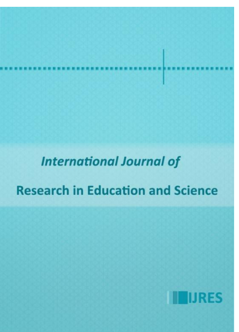
International Journal of Research in Education and Science (IJRES)