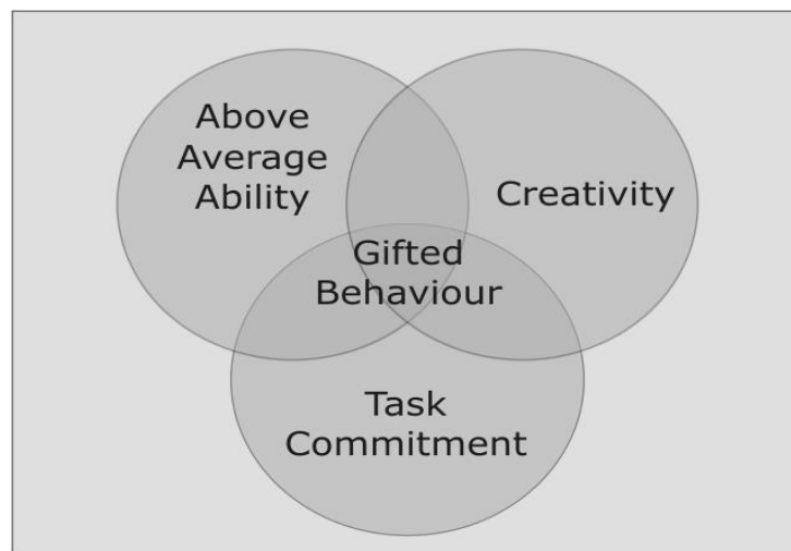
Figure 1. The talent pool resulting from the interaction of the components leading to being gifted (Renzulli, 1978)

Project-based learning, which goes through processes based on specific scientific method and aims to produce a product, develops high-level cognitive skills that include the abilities of students such as data analysis, problem solving, decision making and etc. and it helps to improve their sense of responsibility towards the physical and social environment (Dori and Tal, 2000). When gifted students are considered, there is not a unique program and a teaching pattern or formula that can be applied to them. In general, a good program and teaching starts with a good program and teaching. Program and teaching should be well-structured, rich and of high-level (Tomlinson, 2005). All of the students will have the opportunity to learn according to appropriate level of readiness through a well-structured program and training (Kontaş, 2012).