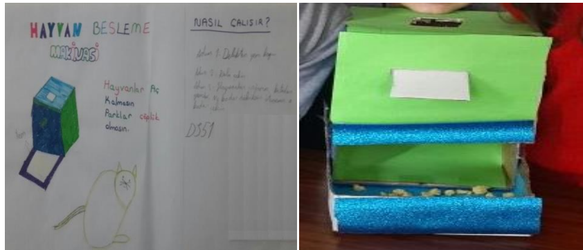
Figure 4. Drawing and picture of animal feed machine project

Student: My hand skills and imagination developed. In addition this product made easier my life.