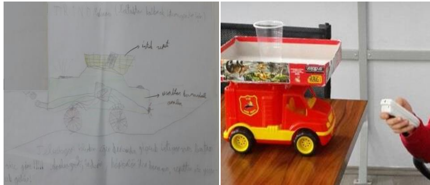
Figure 3. Drawing and picture of trino machine project

At first step of project-based activities, students have carried out their drawings of project imagination and design. After design, they reported their projects' drawing to other friends and teachers. Friends and teacher gave feedback to each other. In accordance with the feedback they implemented the project design. After application, the products are evaluated according to the criteria in the form of observation by teacher and researcher. Projects and students' opinions are located below.