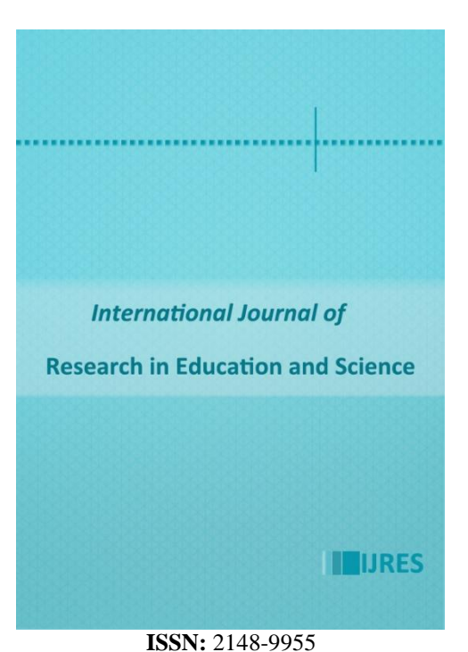
International Journal of Research in Education and Science (IJRES)