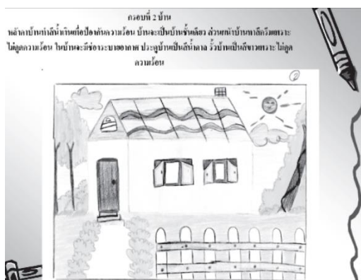
Figure 4. The learner's artifact "The Energy Saving Home" designed on PowerPoint from Ms. Cha's classroom in science grade 9

The researchers found that the PBL using ICT enhanced the learners' five key competencies and learning outcomes. The results of the study revealed that the learners were developed in key competencies: